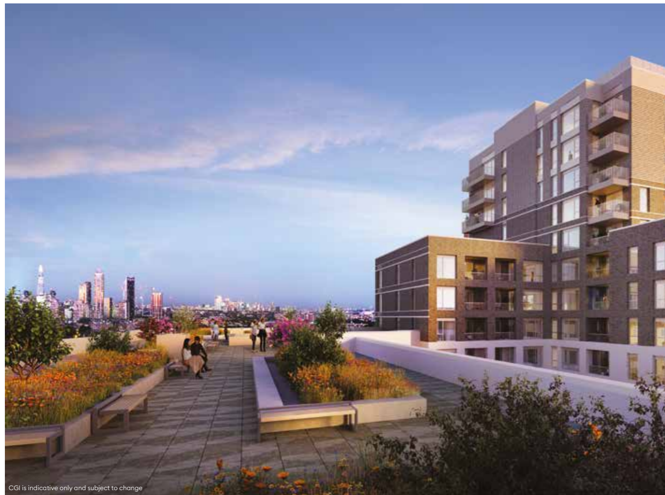
CGI is indicative only and subject to change