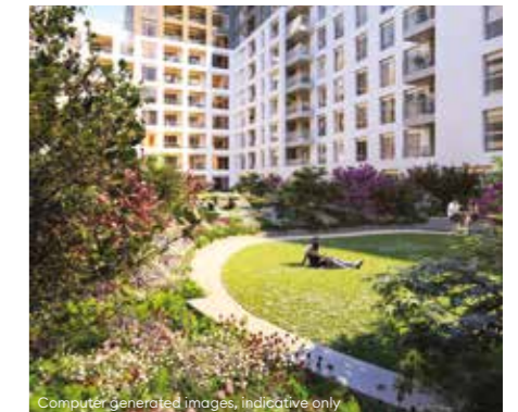
Computer generated images, indicative only