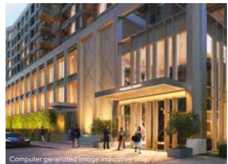
Computer generated image indicative only