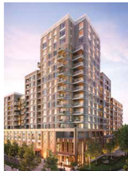
Computer generated image indicative only