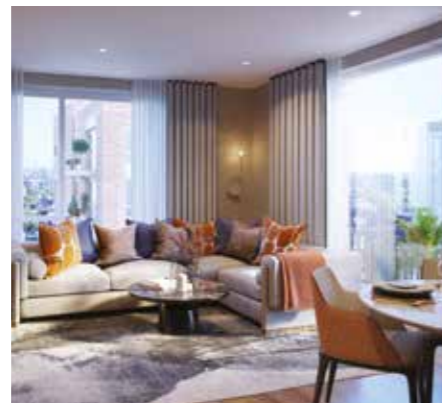
Computer generated images, indicative only